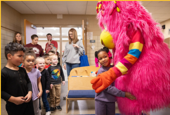
Rosie interacts with kids at Mitchell Early Learning Center

The Rosie team interacted with 1,647 people at community events in December, such as: