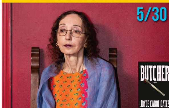
JOYCE CAROL OATES