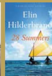
ELIN HILDERBRAND WED, JUNE 9, 7:00 PM