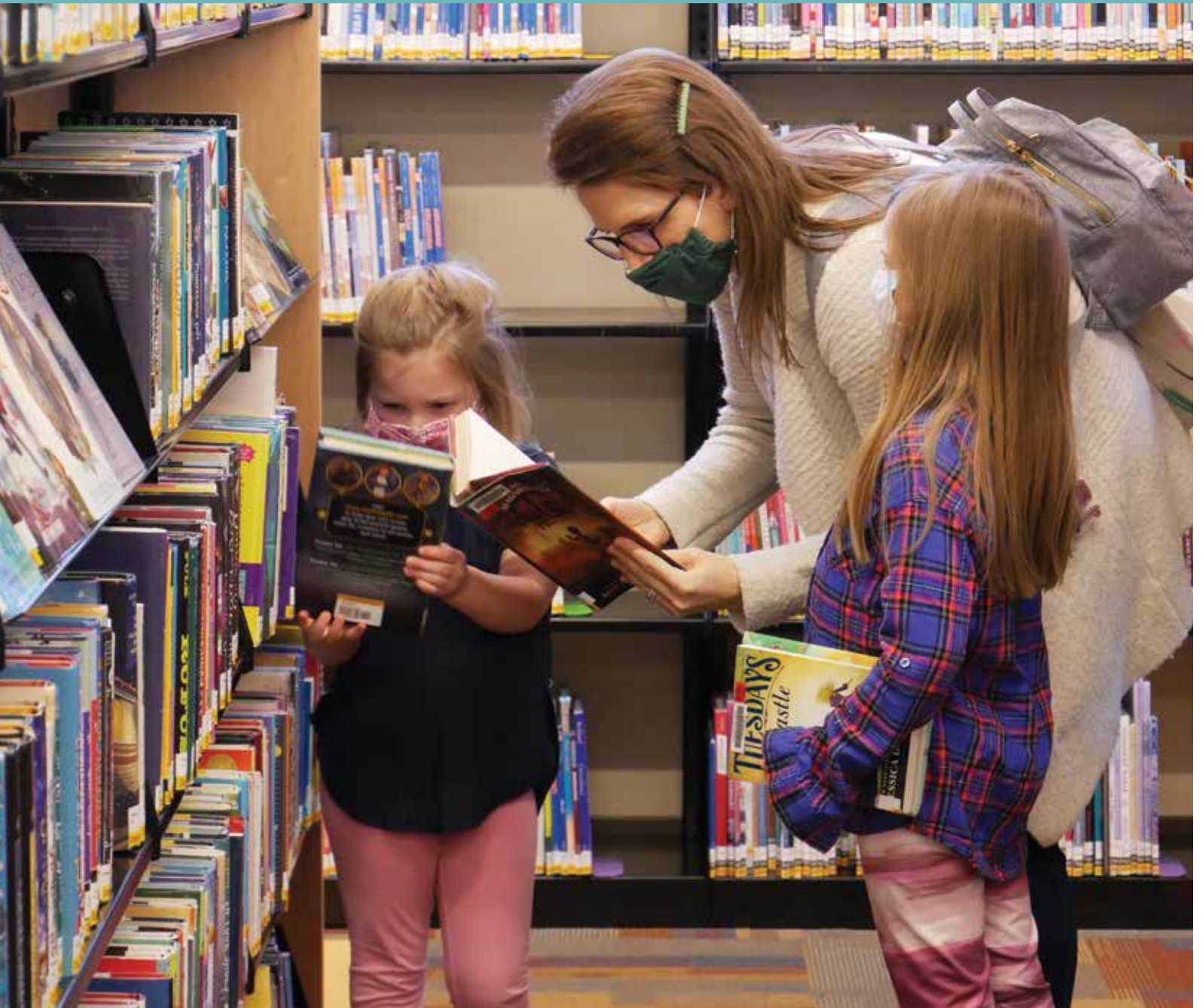
A family browses for books inside Franklin Avenue Library.