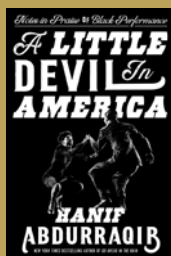
HANIF ABDURRAQIB WED, APRIL 14, 7:00 PM